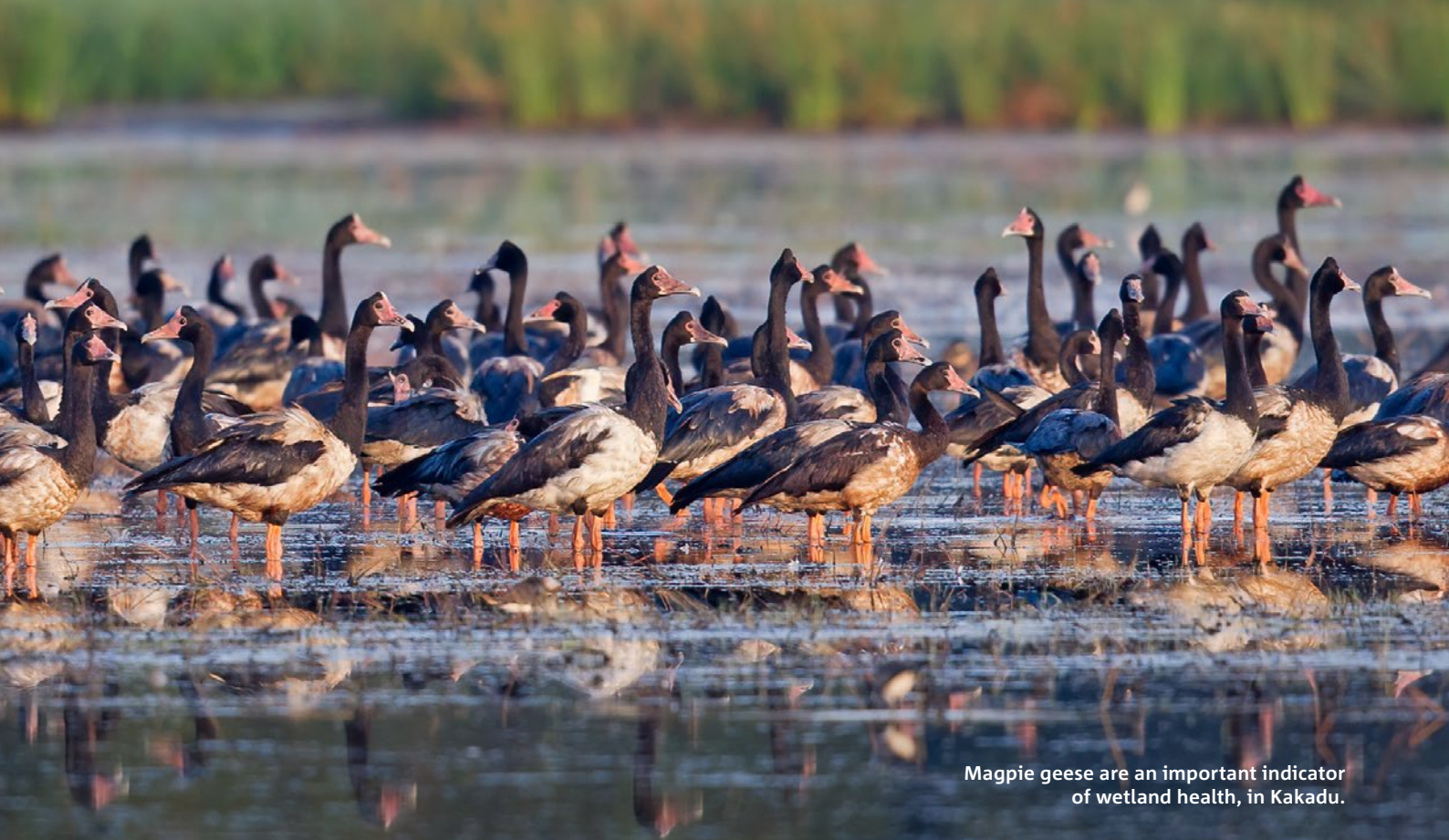
Magpie geese are an important indicator of wetland health, in Kakadu.