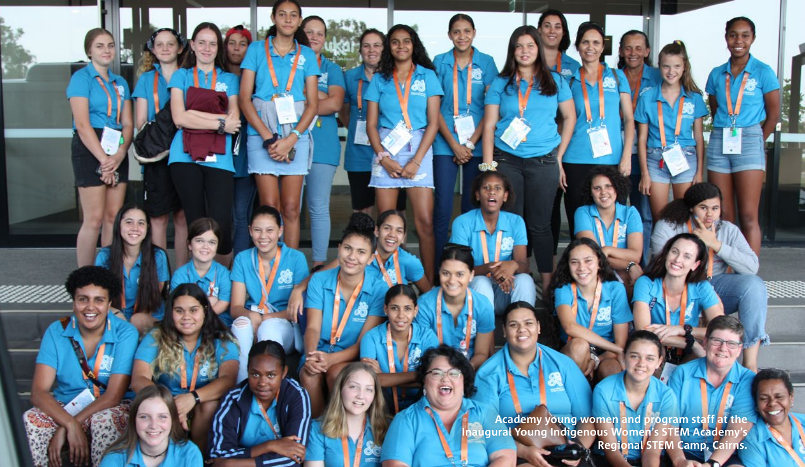
Academy young women and program staff at the Inaugural Young Indigenous Women's STEM Academy's Regional STEM Camp, Cairns.